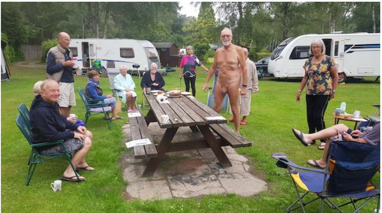
The Birthday Boy

On Thursday 1 July Suntimeckers arrived for the Heritage rally. The pool was open and looked very inviting. The Friday BYO coffee morning was a notable affair, being one of our younger member's special birthday, celebrated with a rich chocolate birthday cake.