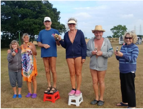
'Top Teams' in the Boules