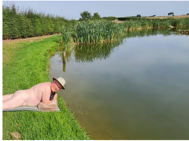
Watching the wildlife