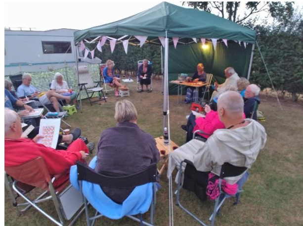
Is that a full House or a full Gazebo?