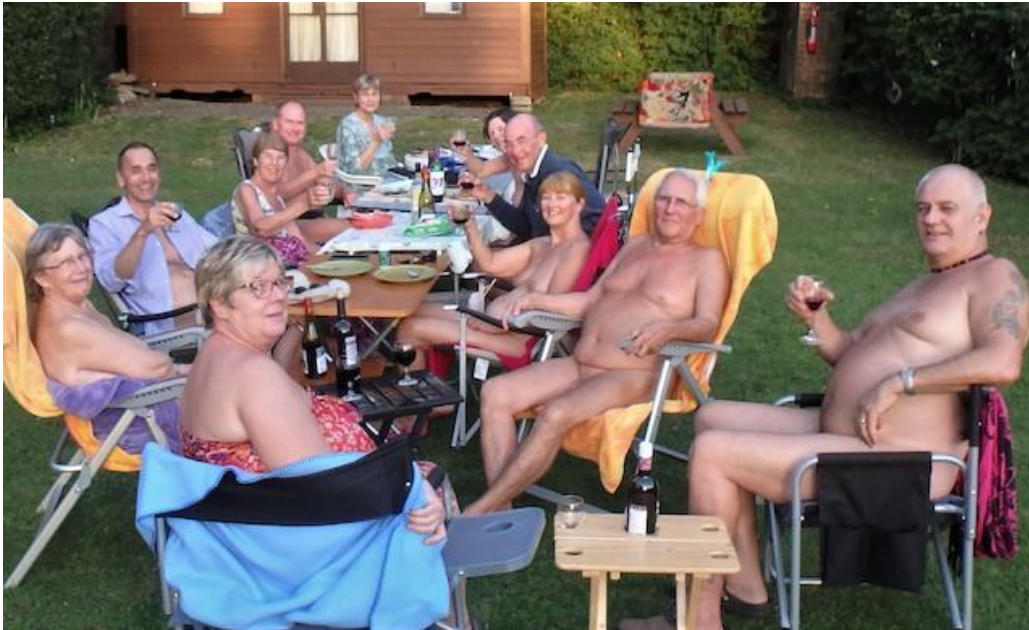
Evening sunshine outside the chalet

Apollo No 3 (September). The weather had been dire; would we be walking about in