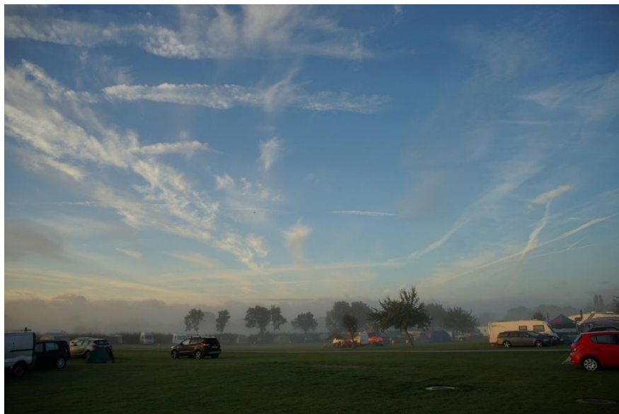
Atmospheric view of the site.