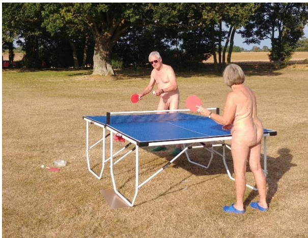
Table tennis – au naturel