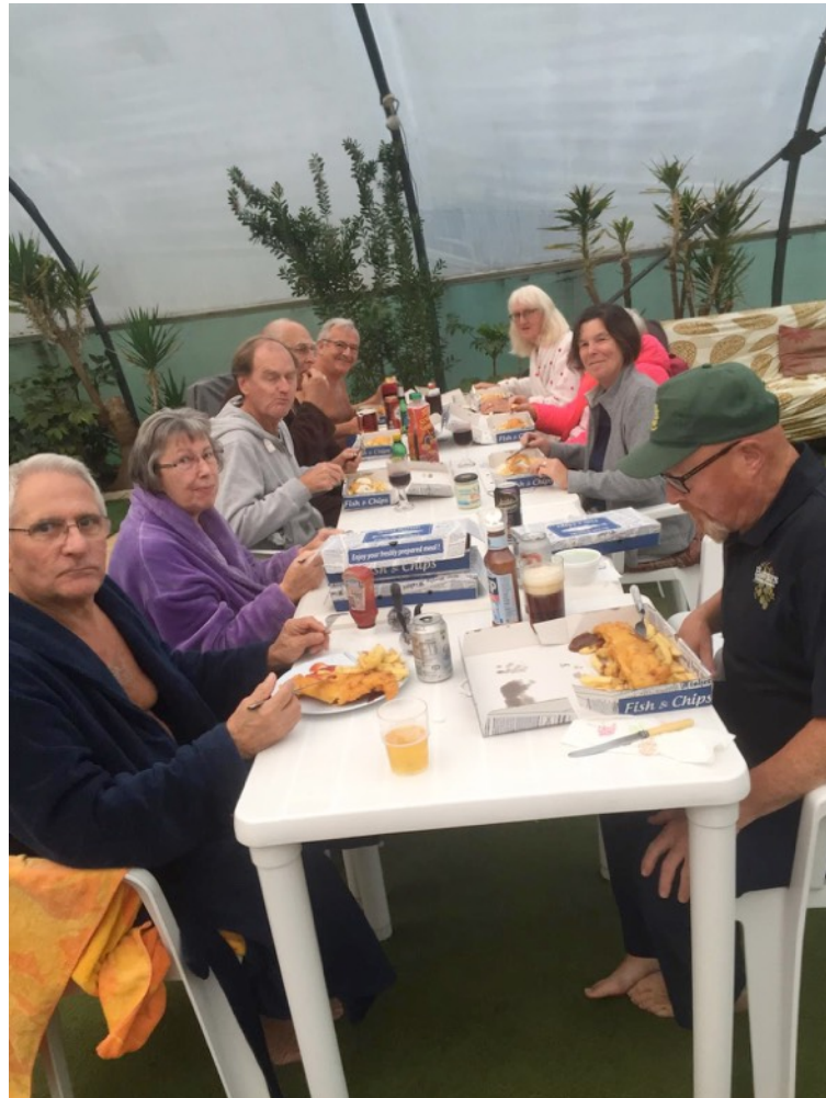
Fish and chip supper