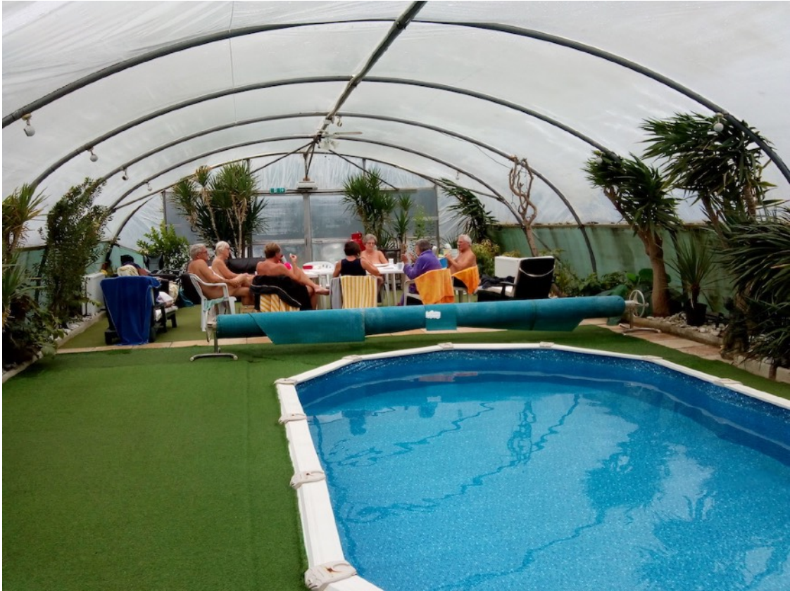
Inside the "Bubble"