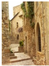
Picturesque Pals market