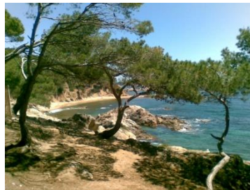
Naturist beach near Castel

How about another walk? Well how about a ride and walk? A couple of volunteers with cars kindly agreed to transport walkers down to nearby Castel beach, a walk around the old castle ruins, a coffee on the beach, and walk back of about one hour to the campsite.