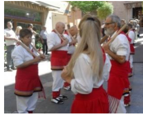
Street performers at Palafrugell