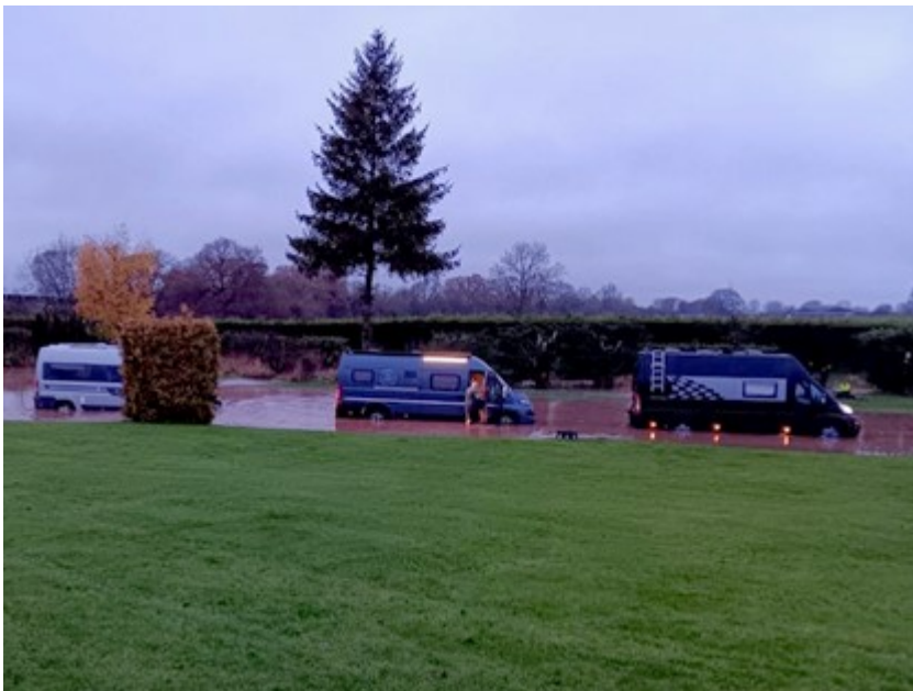
Needing to move quickly in the early morning twilight!