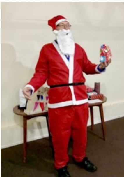
Santa arrives to give out the presents.

By Sunday morning (Boxing Day) the weather had warmed up considerably and it had started to rain. It wasn't long before the grass became very wet and muddy in places making journeys between our vans and the Chicken Shed a bit tricky. There had been some talk of a game of boules, but the weather had put paid to it. Instead, we played indoor Mollky, boys against girls, which the boys eventually won.