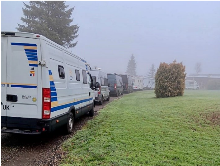
Freezing weather at the start of the rally...