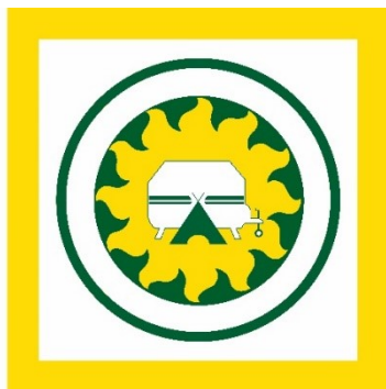
Rally Officer Flag