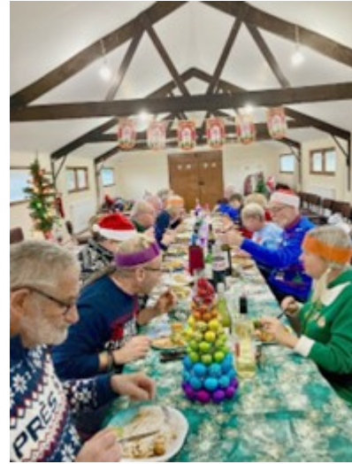
Turkey in the Chicken Shed?

note)! It's amazing how the time flies when it's cosy and warm inside and you're chatting to friends and before long it was time for the chefs to return to their vans and start preparing Christmas lunch, eaten together as usual and all very sociable.